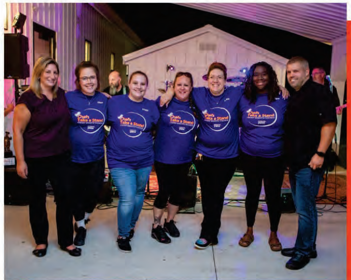
AVV staff and winner of "Best Entree" celebrating a night of incredible food and community support at the Lookout at Hope Lake for the 4th Annual Chefs Take a Stand Against Domestic Violence event on Oct. 3, 2023.

Groups like Power of Change and prevention education trainings offered by AVV staff aim to end the cycle of abuse. Training topics include generational trauma, fostering healthy relationships, victimology, bystander intervention, and more.