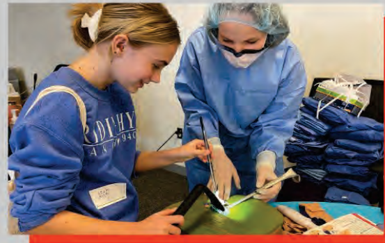
*A GDO participant performing mock surgery with Guthrie at the 2023 GDO Interactive Career Fair.