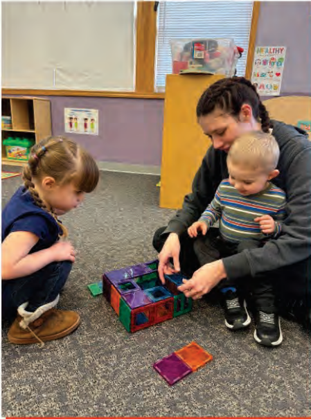
Here We Grow Daycare Center staff engaging students in constructive play.